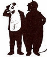
DIE BEIDEN AUTOREN THE AUTHORS

ORDER ORDNUNG UND AND REINLICHKEIT CLEANLINESS